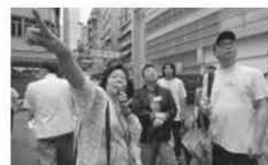
Local resident as tour guides