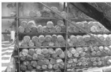
Cultivation of Coral Mushroom

Time Coupons are earned based on amount of labour time provided (1 hr.= 60 unit of time coupon). Participants receive time coupons that can be exchanged for goods and services in :