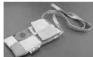
Bags made from recycled clothes