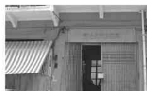
Museum: Blue House

is formed by grass root residents to sell snacks and drinks for members of St. James' Settlement Community Center.